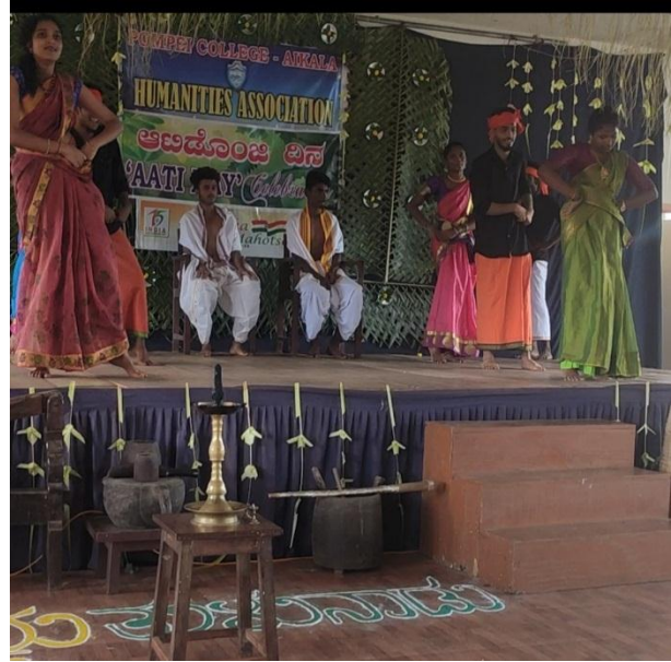
Aatidonji Dina Celebration

Cultural Programme on Independence Day: To instill Patriotism among the students Department of History organized Cultural Programme on the occasion of Independence Day Celebration on 15 th August 2022.