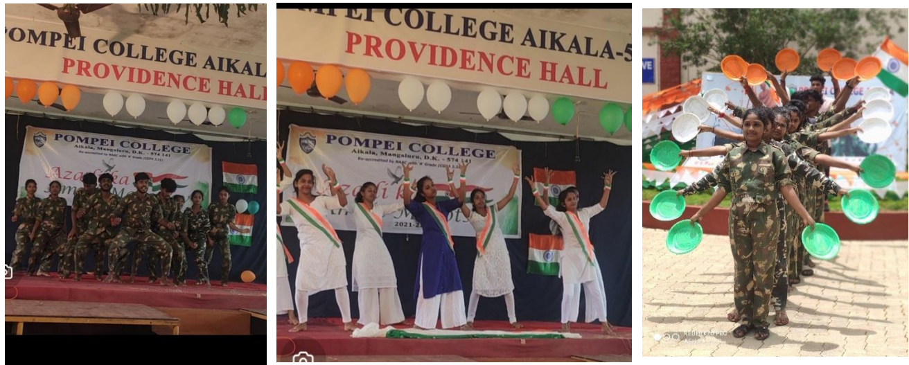
Cultural Programme on Independence Day

Librarian’s Day: Librarians Day organized by Department of Library and Readers’ Club with Humanities Association on 25/08/2022.